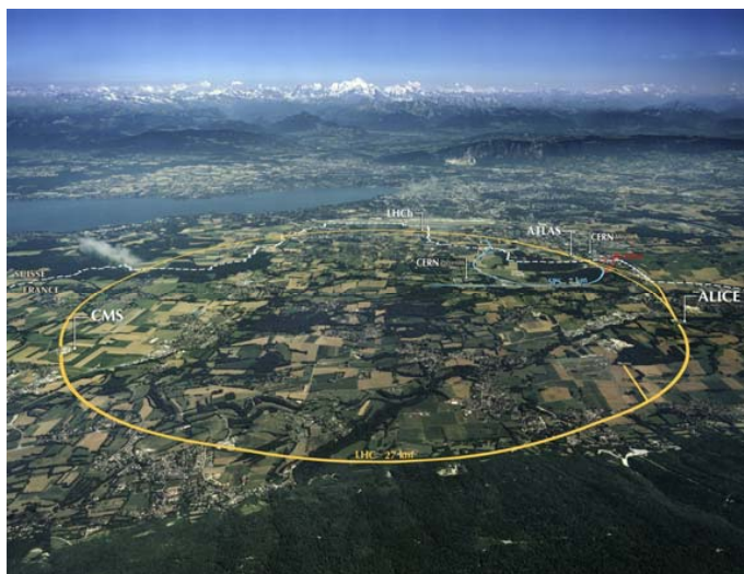
Aerial view of CERN

Research and development is taking place for eventual upgrades to the tracking detectors for both ATLAS and CMS to extend the scientific reach of these experiments even further.