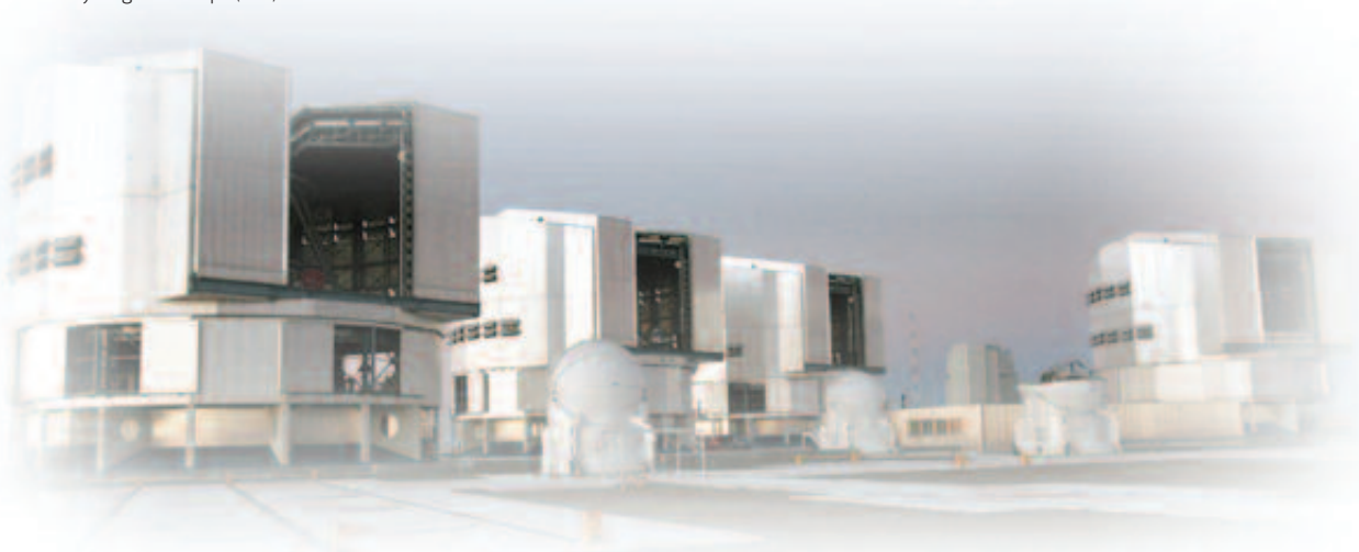
The Very Large Telescope (VLT)

These new instruments will also be able to trace the assembly history of galaxies over virtually all of cosmic time, decoding the physical processes that shape their evolution.