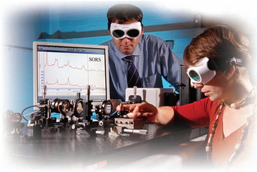
Aligning the Spatially Offset Raman Spectroscopy (SORS) instrument