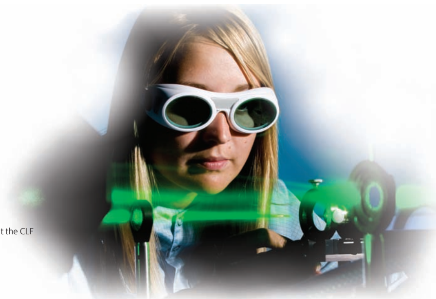
Optics being aligned on a laser system at the CLF

The study has been funded by the Accelerator Science and Technology Centre (ASTeC) with cross-departmental involvement within STFC, including collaboration with STFC's e-science department through the use of the CLF's SCARF LEXICON supercomputer and the Instituto Tecnico in Lisbon, Imperial College London and the Universities of St Andrews, Lancaster and Strathclyde. It has also been made possible through a grant from one of STFC's sister councils, the Engineering and Physical Sciences Research Council (EPSRC).