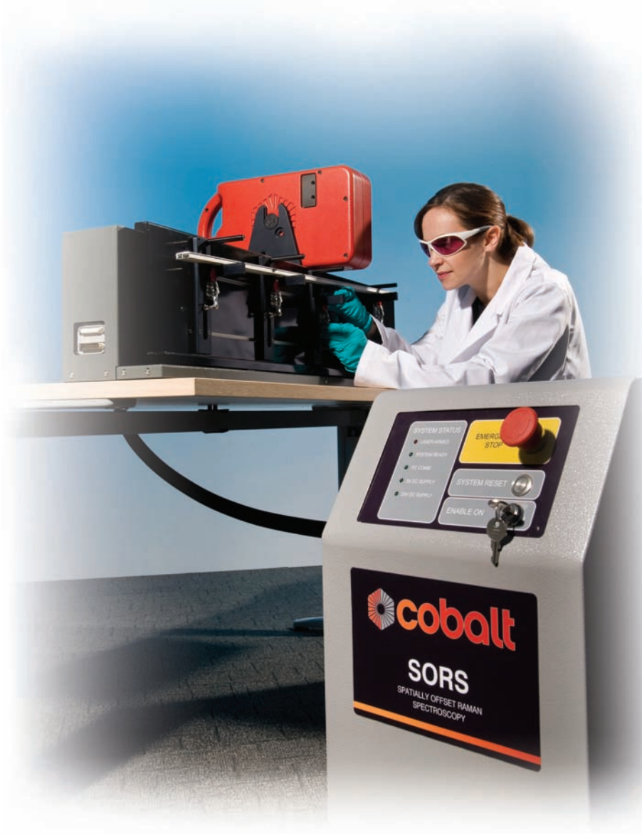
Aligning the Spatially Offset Raman Spectroscopy (SORS) instrument

The SORS technique was patented at STFC's Central Laser Facility (CLF) in Oxfordshire, and the instrument developed for bone scanning through collaboration with the CLF's spin out company, Cobalt Light Systems Ltd, and the Institute of Orthopaedics and Musculoskeletal Science at University College London, one of the UK's specialist centres for bone disorders. more