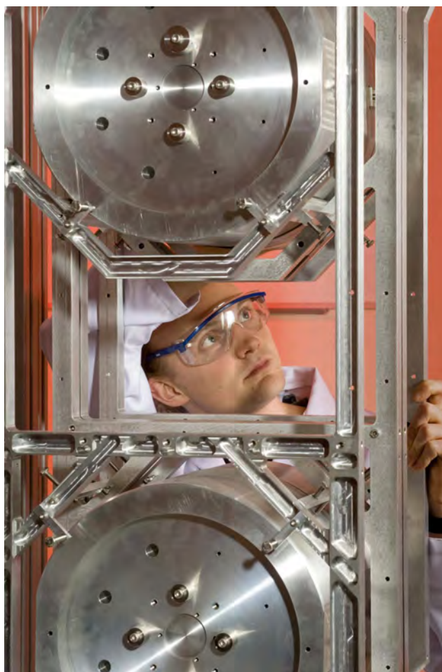
Looking up inside the Advanced LIGO suspension.

and solutions to some of the world's most critical social and economic challenges.