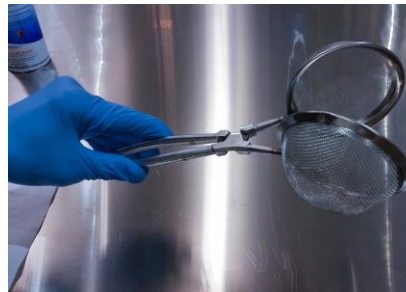
Another great engineering solution brought to you by CERN!

Faced with the challenge of cleaning hundreds of tiny screws in the jet of gas, the team came up with the ingenious idea of welding two tea strainers to a pair of pliers. The screws are placed in the tea strainers and can be thoroughly cleaned without any danger of spillage.